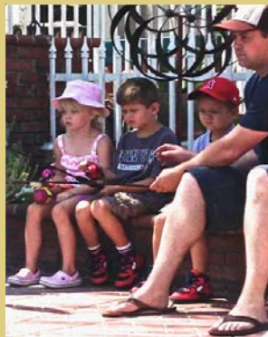
Three little ones fishing for the first time on a Via Morena dock.

Email your FREE 30-word classified ad to caps001@aol.com . Ads run one issue. Residents only.