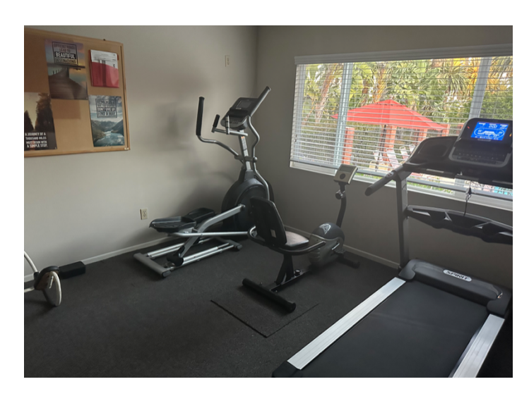
Please remember that: